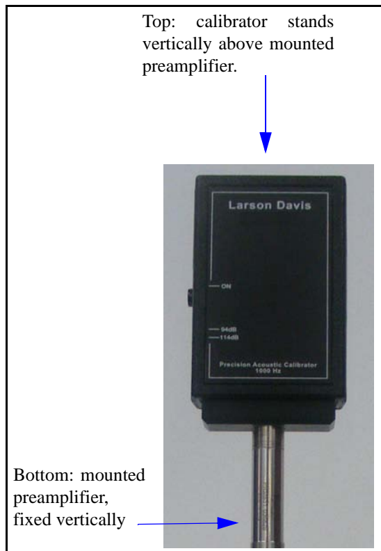
FIGURE 2-1 Vertical Positioning